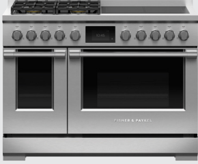
A FREESTANDING RANGE 30", 36" OR 48"