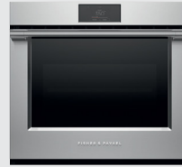
AND A BUILT-IN OVEN 24" OR 30"